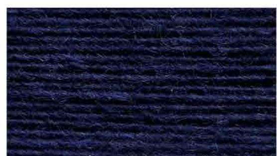
1187 MIDNIGHT BLUE