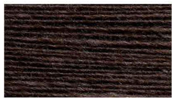
1186 BURNT UMBER