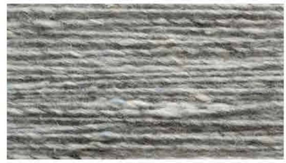
1625 SILVER MIST

Coming from the Gaelic word for, 'elegant' Galanta will produce a luxurious knitted on 3,5,7 Gg or woven fabric to enhance any collection. Stock supported in oil on 1 kilo cones.