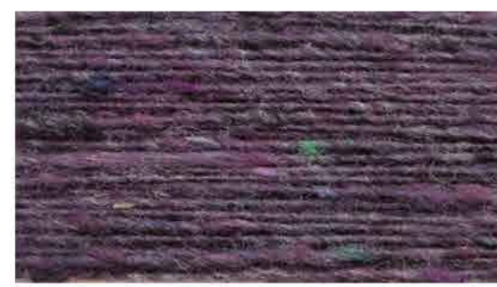
1610 PURPLE HEART