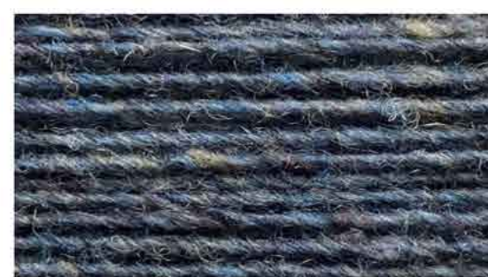
1167 BLUE THISTLE