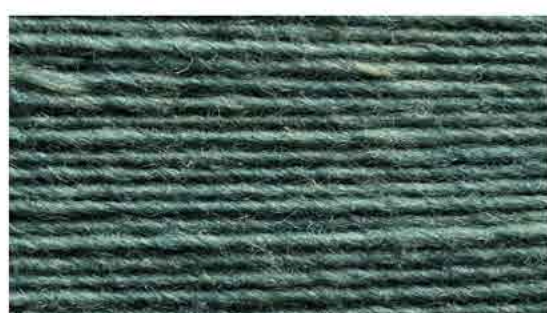
1188 GREEN IVY