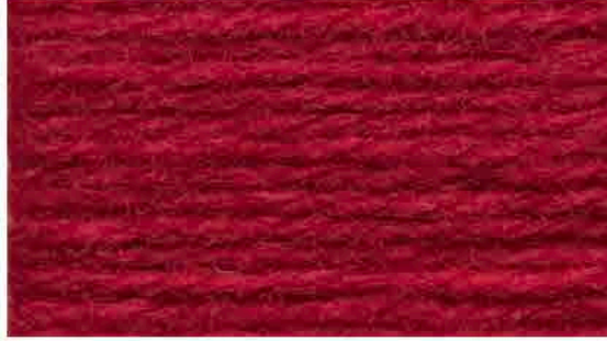
3717 BERRY CRUSH