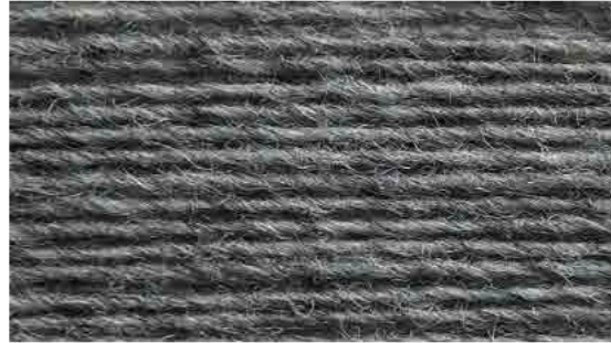
8003 GREY STONE