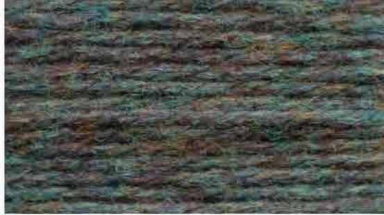
4671 OCEAN SPRAY