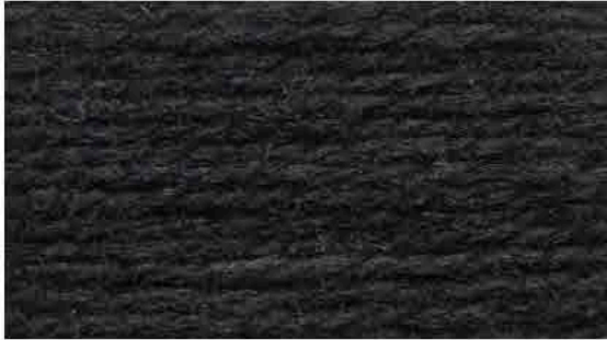
3023 AFTER DARK