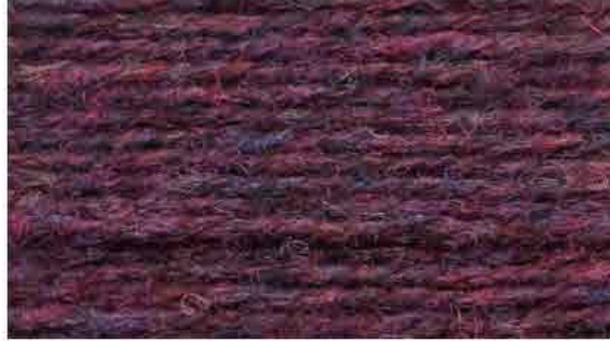
8093 WILD HEATHER