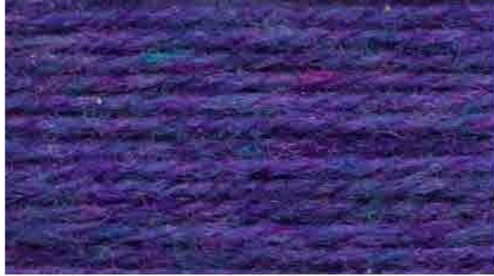
8053 BLUE BELL