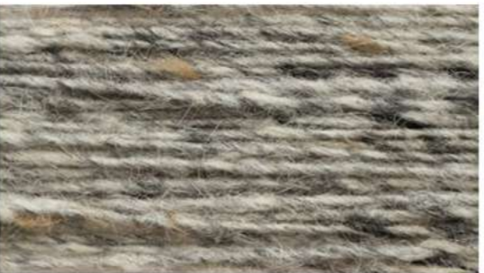
2704 SILVER BELL