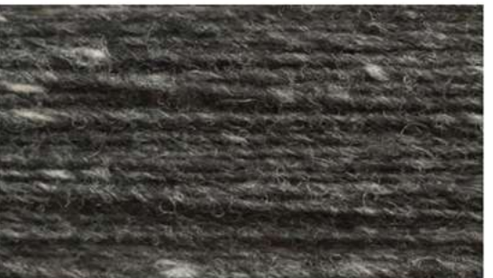
2708 BLACK BIRCH