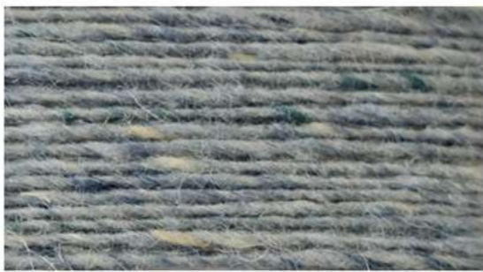
2730 SKY MIST