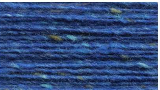
2728 BLUE PRINT