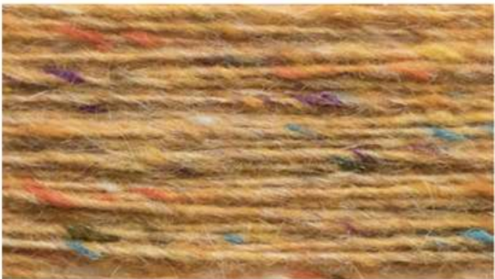
2725 GOLDEN ASH