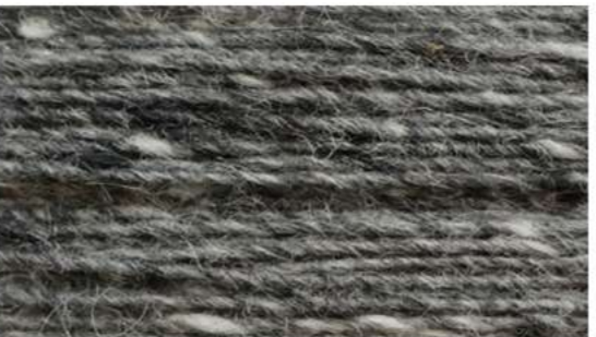
2705 GREY ALDER