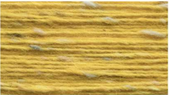
2729 LEMON DROP